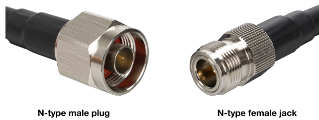
Figure 1: Connector Types